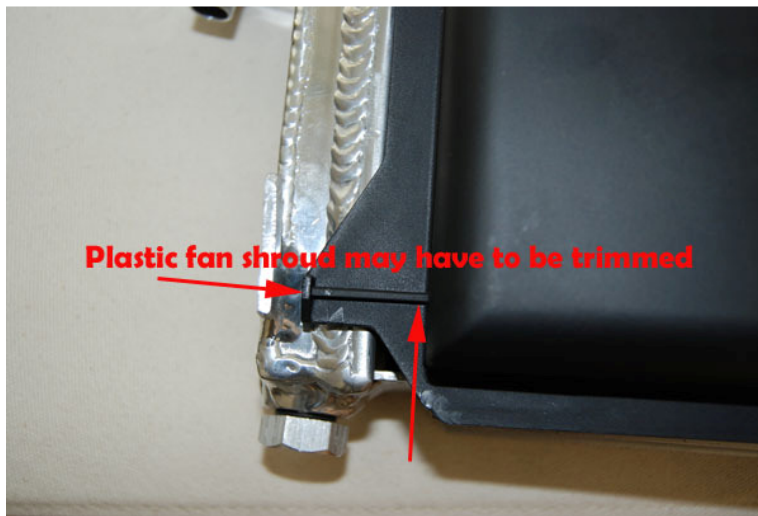
Picture 2: The plastic fan shroud may have to be trimmed at there the line going across is located.